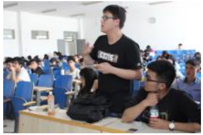
Chinese Students in Lanzhou respond to talks on American Literature.